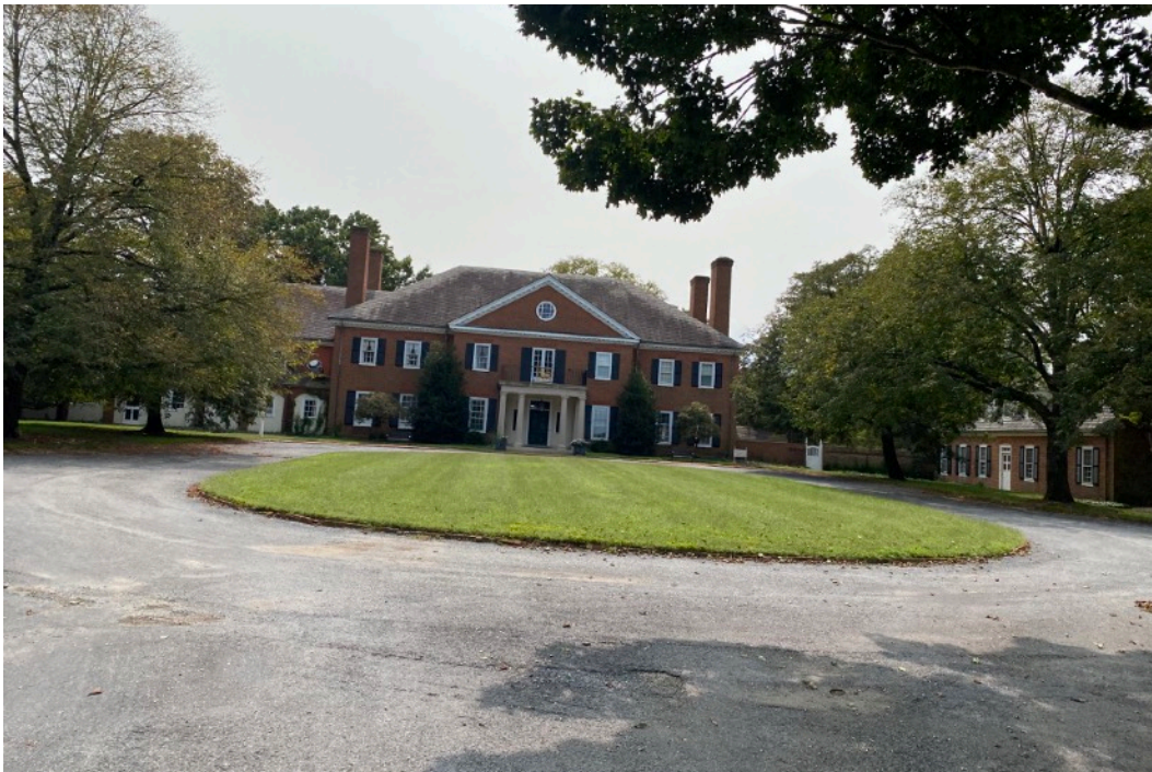
The Aspen Institute's American Eagle Ballroom

120 people. One never forgets a meal or visit in that ballroom. They were seated in round tables of eight. The ballroom walls are rich-colored cedar woods panels expertly crafted with darkly stained pine wood crown molding. On the walls were portraits of all our past presidents. Low hanging crystal chandeliers with hundreds of softly lit small lights adorn above each table. Table cloths were a rich gold weave of linen with a candelabra in the center. Full service China and wine glasses made for a luxurious meal each evening these elite guests dined among themselves. There was no head table, how could one have a head table with the most respected Americans dining together?